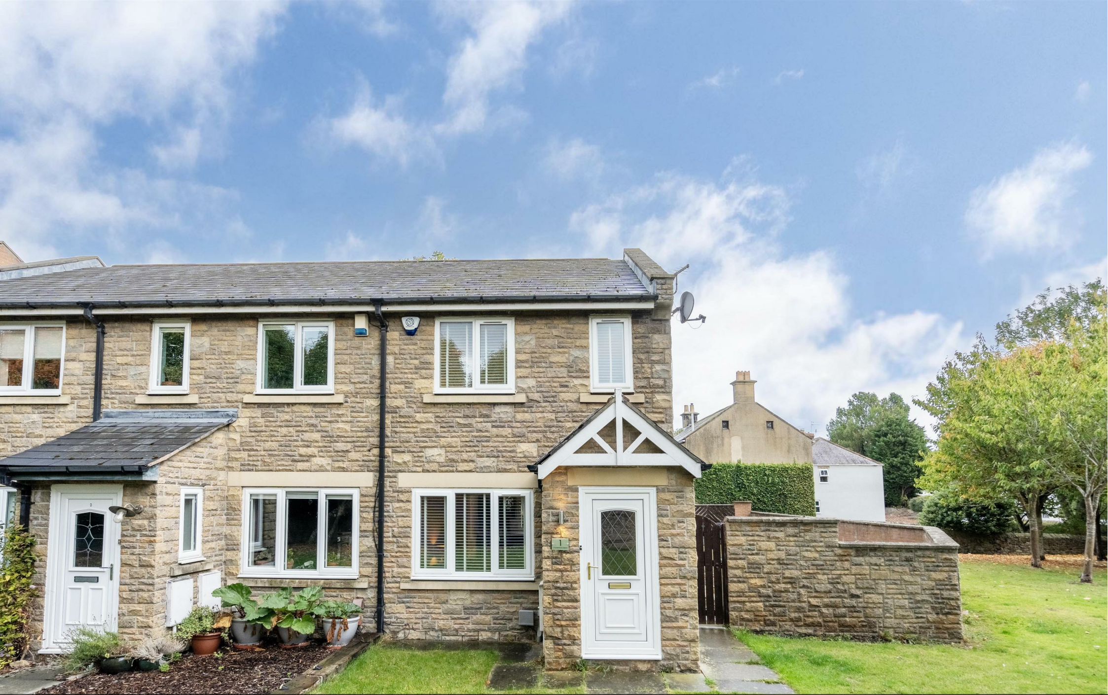
📍 Chollerford Mews, Whitley Bay NE25 0TX